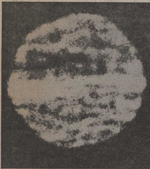
SPOTTED . . . over New Zealand, Dec. '78

● HAVE you seen a UFO recently? If you think so, tell us about the experience. Write to: UFOs, Daily Star, 121 Fleet Street, London EC4P 4JT.