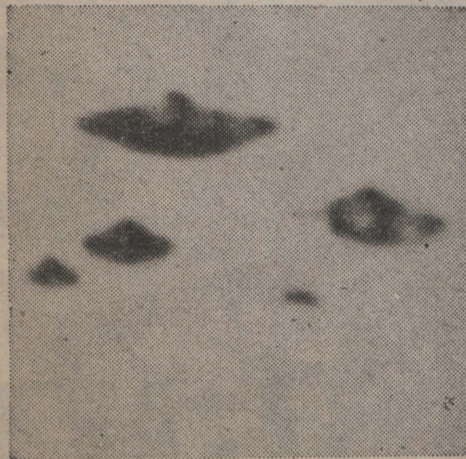
SPOTTED . . . Sheffield 1963