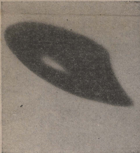
SPOTTED . . . Pheonix 1947