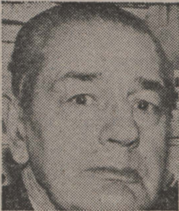
Lord Clancarty: "It's a Whitehall cover-up"

Lord Clancarty, leader of the peers, is determined to call a full House of Lords debate on UFOs after getting defence officials to admit they examined reports of 2,250